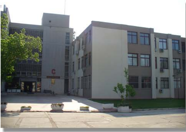
EGE UNIVERSITY AGRICULTURE FACULTY